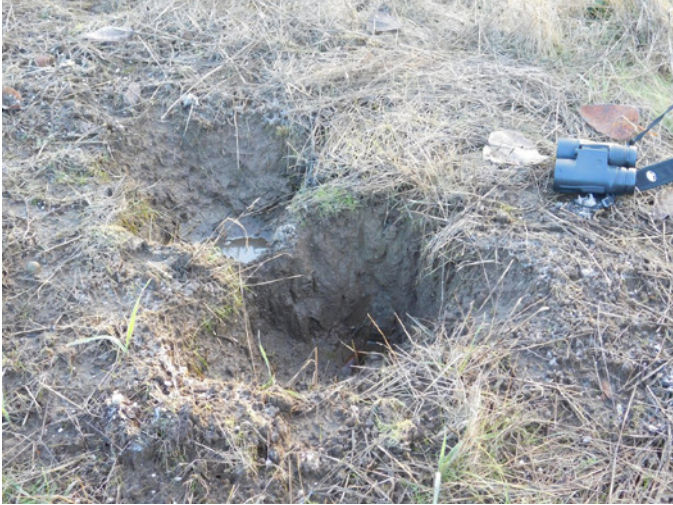
Diggings apparently made by a Black Bear at Luckiamute State Natural Area.

Dec. Along with the possibility of more Bohemian Waxwings, keep an eye open for Pine Siskin flocks and more rare northern finches such as Common Redpolls. Please post your observations to the Mid-Valley birding list at midvalleybirding.org , e-mail them to me at joel.geier@peak.org , send by post to 38566 Hwy 99W Corvallis 97330, or call (541) 745-5821 by 24 Jan. Meanwhile happy birdwatching in the New Year!