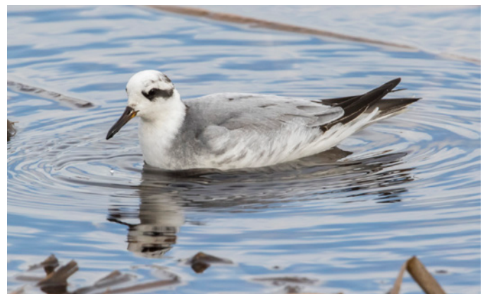
Red Phalarope