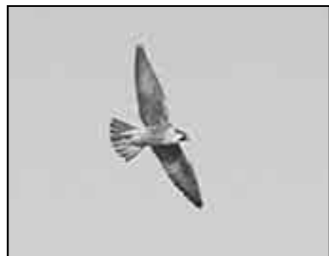
This Peregrine was patrolling over Cabell Marsh at Finley National Wildlife Refuge.