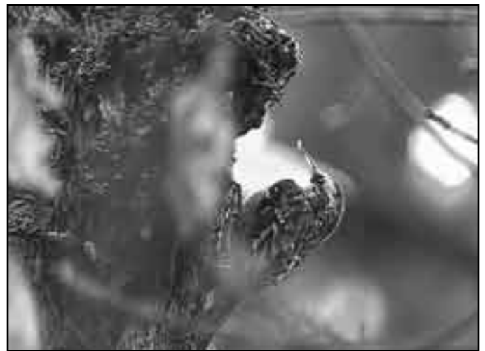
A Brown Creeper snatches a tiny insect from the bark of an Oregon Ash.