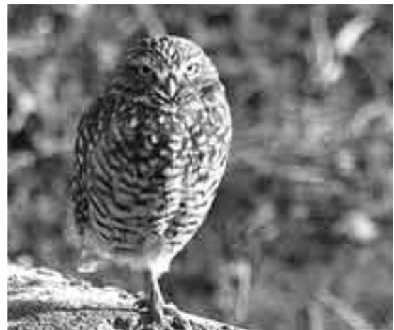
A Burrowing Owl on Davis Road, Linn County, 3 Nov

In town, gulls often use light posts as high perches from which to survey the landscape for food. A gull-on-the-post at the Jack-in-the-Box in north Corvallis, 5 Nov, caught Carolyn Paynter's attention. On 11 Nov, 2 adult gulls were there, again lounging on light posts to keep watch for stray scraps; both appeared to be Glaucous-winged x Western Gull hybrids. In nearby Linn and Marion counties, gulls are usually